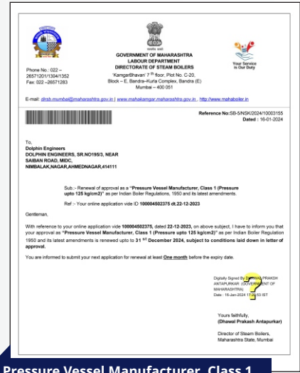
Pressure Vessel Manufacturer, Class 1