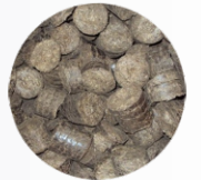
Solid Waste Briquette