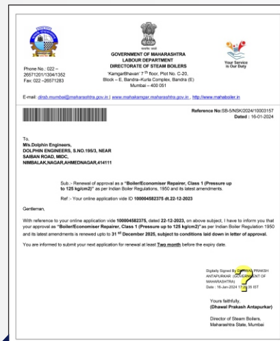
Boiler/Economiser Repairer, Class 1