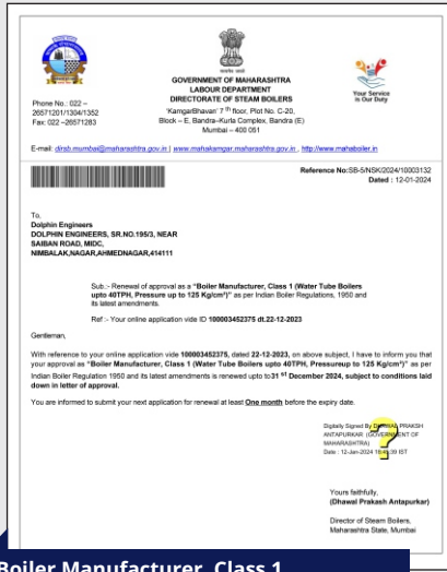
Boiler Manufacturer, Class 1