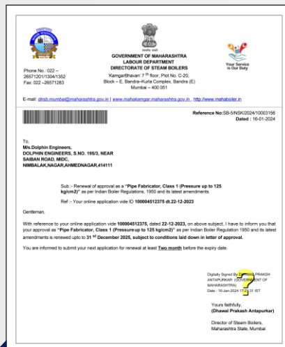
Pipe Fabricator, Class 1