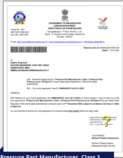
Pressure Part Manufacturer, Class 1